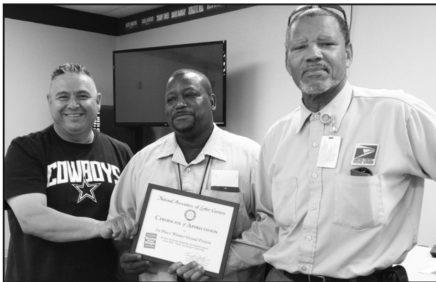
GRAND PRAIRIE MAIN